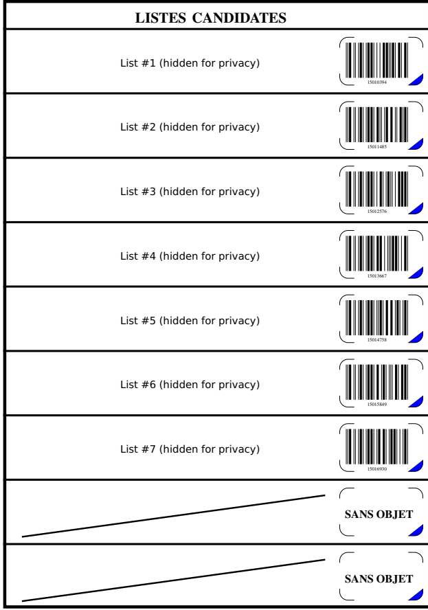
Figure 2. The sheet with the names of the lists running for the election (hidden here for privacy). A sticker with an 8-digit barcode is associated with each list.

2) List identifiers : Let us now consider the last 4 digits of the list identifiers: 0394, 1485, 2576, 3667, 4758, 5849, and 6930. The somewhat regular increasing of these 4-digit sequences, when seen as decimal integers, hints at a kind of arithmetic progression. Indeed, there appears to be a common difference of 1091 between the first 6 numbers. However, trying to extend this guess to the last one, one remarks that 5849 + 1091 is 6940 and not the observed 6930: it seems that the first carry digit was not propagated to the second digit. This led us to believe that the last digit had to be considered separately, as would be the case for a check digit, for instance.