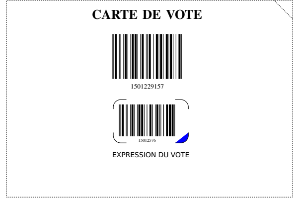
Figure 3. A cast ballot. The 8-digit barcode for the chosen candidate list (here list #3) is affixed just above the mention “ Expression du vote ”.

Alternatively, one might also look at the last 4 digits of the list IDs individually and remark that each of them forms an increasing sequence, except for the third one which is decreasing. In other words, noting xyzt the last 4 digits of