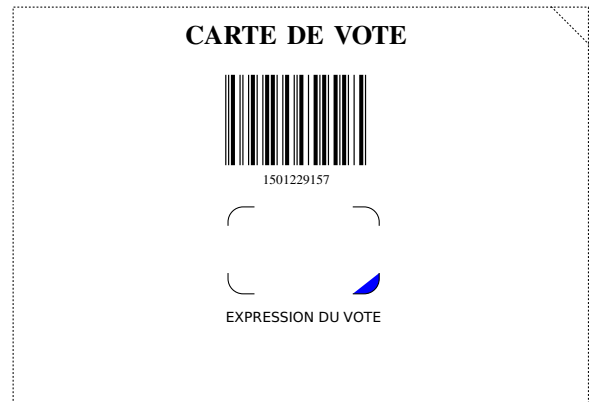
Figure 1. A blank ballot. The upper 10-digit barcode identifies the voter.

To sum up, once the voter has made his/her decision, he/she affixes the corresponding sticker on the ballot (Fig. 3), and then mails the ballot inside an anonymized envelope.